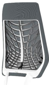
Caption: The JOYCEis3 FlexGrid mirrors human anatomy. It supports the spine's natural curvature using two innovative components with different levels of hardness. This ensures that stability and flexibility are optimally balanced.