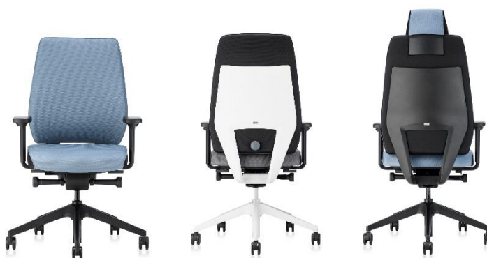
Caption: In the upholstered version, JOYCEis3 combines a comfortably soft seat with high-grade design.

Company Interstuhl Büromöbel GmbH & Co. KG Brühlstraße 21 72469 Meßstetten-Tieringen Germany Tel.: +49 (0) 7436 871 0 Fax: +49 (0) 7436 871 110 info@interstuhl.de interstuhl.com