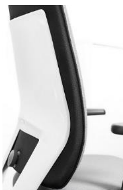
Caption: High-grade decorative welted seam between the upholstery cover and technical fabric.