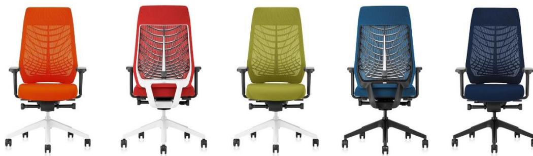
Caption: JOYCEis3 particularly stands out thanks to its wide variety of colour options.