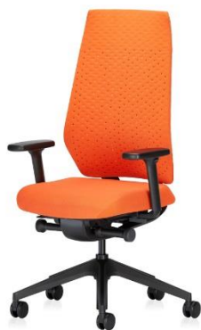
Caption: With the new Softback, JOYCEis3 combines the advantages of a traditional upholstery with those of a mesh cover.

Company Interstuhl Büromöbel GmbH & Co. KG Brühlstraße 21 72469 Meßstetten-Tieringen Germany Tel.: +49 (0) 7436 871 0 Fax: +49 (0) 7436 871 110 info@interstuhl.de interstuhl.com