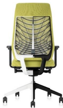
Caption: Backrest frame, chair column and base are available in two colour concepts – black or light grey.